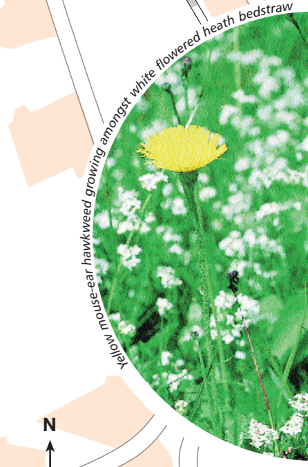
Yellow mouse-ear hawkweed growing amongst white flowered heath bedstraw