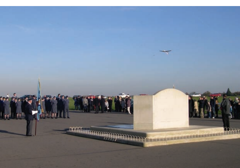
Remembering Kenley's heritage